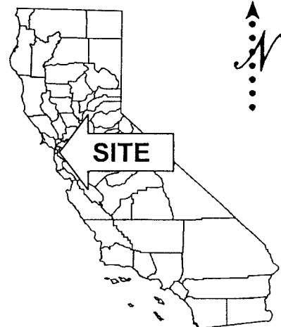
Exhibit A PRC 6397.9 MAINTENANCE DREDGING

This exhibit is solely for purposes of generally defining the lease premises, is based on unverified information provided by the Lessee or other parties, and is not intended to be, nor shall it be construed as a waiver or limitation of any State interest in the subject or any other property.