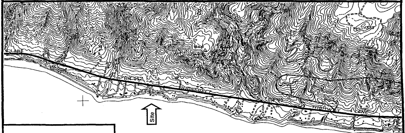
Exhibit A W24665 33608 Pacific Coast Highway