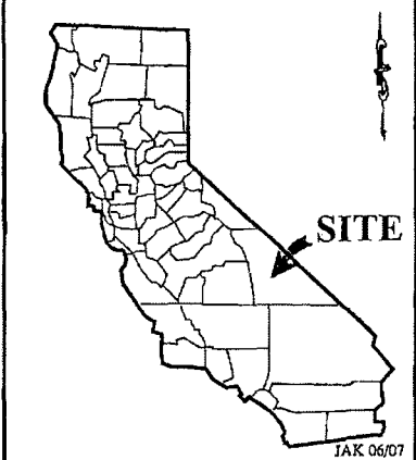
Exhibit A WP 8743 LADWP GEOLOGICAL SAMPLING PERMIT OWENS LAKE INYO COUNTY

This Exhibit is solely for purposes of generally defining the lease premises, is based on unverified information provided by the Lessee or other parties and is not intended to be, nor shall it be construed as, a waiver or limitation of any State interest in the subject or any other property.