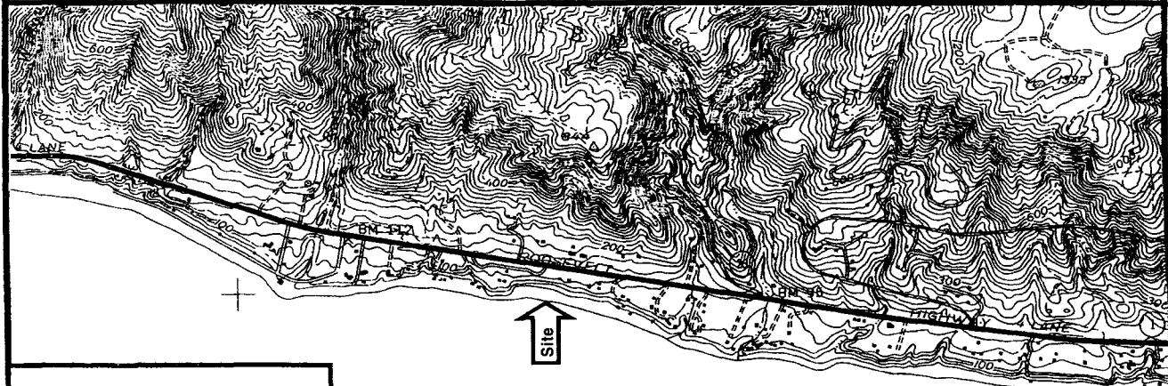
Exhibit A W24665 APN 4473-020-018