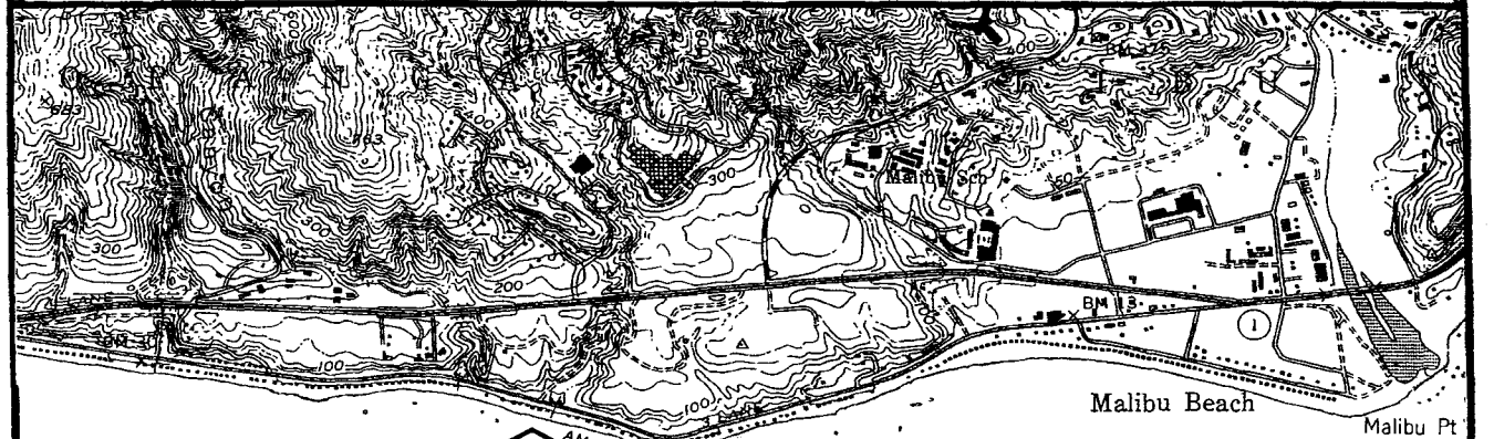
Exhibit A W24665 24626 Malibu Road