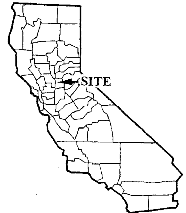
Exhibit A PRC 4812.1 GLIDEWELL GENERAL LEASE COMMERCIAL USE SACRAMENTO RIVER SACRAMENTO COUNTY