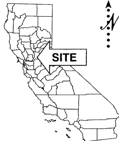
Exhibit A PRC 7001.1