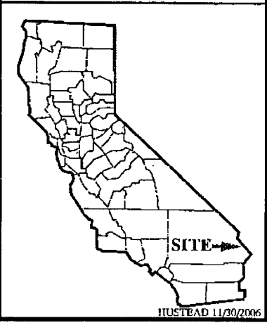
Exhibit A PRC 8737.1 PG&E GENERAL LEASE RIGHT OF WAY USE NEAR NEEDLES,CA SAN BERNARDINO COUNTY

This Exhibit is solely for purposes of generally defining the lease premises, is based on unverified information provided by the Lessee or other parties and is not intended to be, nor shall it be construed as, a waiver or limitation of any State interest in the subject or any other property.