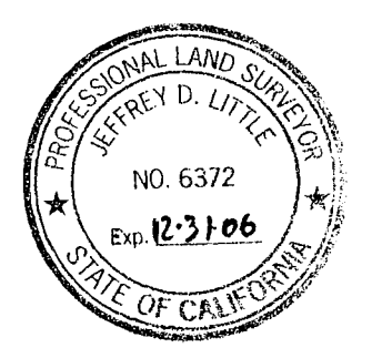
Offrey D. Little PLS 6372 Expires 12-31-06

Area, Region or Location: 4 Land Service Office Fresno Operating Department: Gas Trans. County: San Bernardino OR 8061116 Dwg. JL-423 T7N, R24E, SBB&M Sec. 8: E1/2 of NE1/4 JCN 03-06-088 Prepared By: MAV Checked By: JDL7 Revision: 2