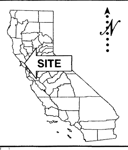
Exhibit A PRC 5534

This exhibit is solely for purposes of generally defining the lease premises, is based on unverified information provided by the Lessee or other parties, and is not intended to be, nor shall it be construed as a waiver or limitation of any State interest in the subject or any other property.