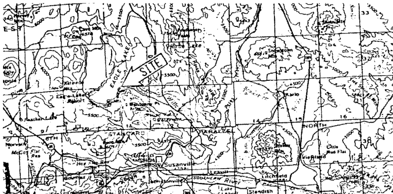
Exhibit A-1 WP 7369