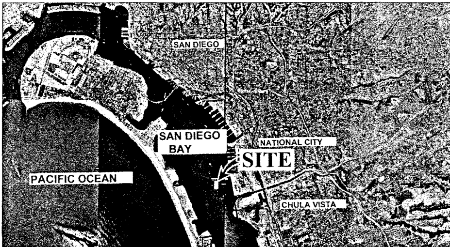
MAP SOURCE: AERIAL PHOTO

This Exhibit is solely for purposes of generally defining the lease premises, is based on unverified information provided by the Lessee or other parties and is not intended to be, nor shall it be construed as, a waiver or limitation of any State interest in the subject or any other property.