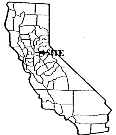
Exhibit A WP 5498 APN:142-0080-065,-067 & 142-0090-008 GENERAL LEASE COMMERCIAL USE SACRAMENTO COUNTY

This Exhibit is solely for purposes of generally defining the lease premises, is based on unverified information provided by the Lessee or other parties and is not intended to be, nor shall it be construed as, a waiver or limitation of any State interest in the subject or any other property.