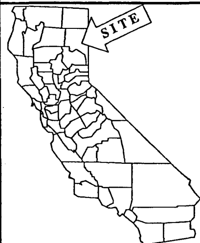
EXHIBIT A PRC 7879.2 Por. APN 81-130-11 School Lands Lassen County

This Exhibit is solely for purposes of generally defining the lease premises, and is not intended to be, nor shall it be construed as, a waiver or limitation of any State interest in the subject or any other property.