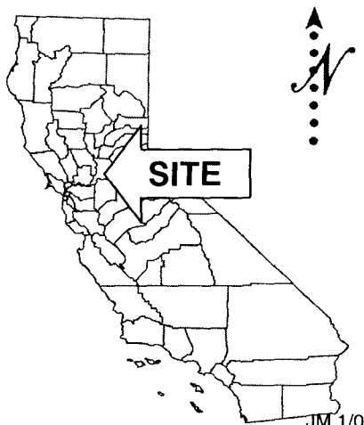
Exhibit B WP 7168.9

This exhibit is solely for purposes of generally defining the lease premises, is based on unverified information provided by the Lessee or other parties, and is not intended to be, nor shall it be construed as a waiver or limitation of any State interest in the subject or any other property.