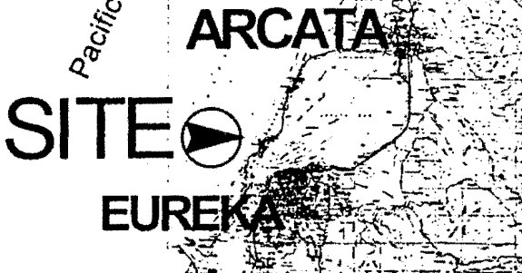
Exhibit A PRC 3186 Evergreen Pulp, Inc. Outfall Pipeline APN 401-111-06 HUMBOLDT COUNTY