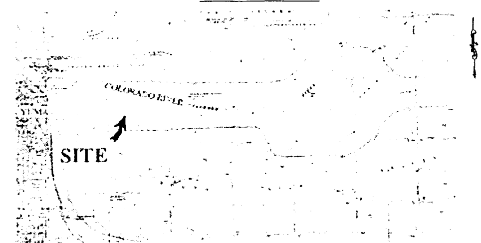
Exhibit A W 26015 WETLANDS RESTORATION COLORADO RIVER YUMA COUNTY