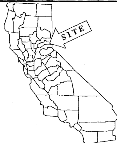
EXHIBIT "A" PRC 7805.9 Recreational Pier Permit DONNER LAKE PLACER COUNTY Sheet 1 of 2 Sheets

This Exhibit is solely for purposes of generally defining the lease premises, and is not intended to be, nor shall it be construed as, a waiver or limitation of any State interest in the subject or any other property.