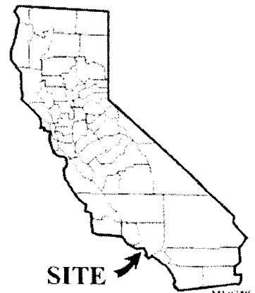
Exhibit A APN 4451-006-036&037 W 24665 ACCEPTANCE OF OTD PUBLIC EASEMENT CITY OF MALIBU LOS ANGELES COUNTY

This Exhibit is solely for purposes of generally defining the location of subject property and is not intended to be, nor shall it be construed as, a waiver or limitation of any State interest in the subject or any other property.