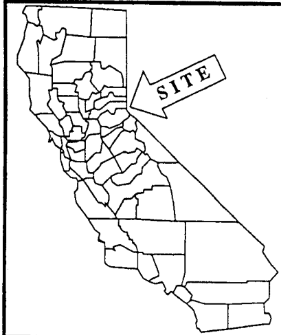
EXHIBIT "A" PRC 5858 Sunnyside Marina APN 84- 140 - 28 LAKE TAHOE PLACER COUNTY

This Exhibit is solely for purposes of generally defining the lease premises, and is not intended to be, nor shall it be construed as, a waiver or limitation of any State interest in the subject or any other property.