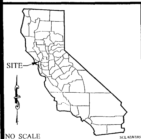
EXHIBIT B PARTIAL QUITCLAIM OIL AND GAS LEASE TO CSLC

This Exhibit is solely for purposes of generally defining the lease premises, and is not intended to be, nor shall it nor shall it be construed as, a waiver or limitation of any state interest in the subject or any other property.