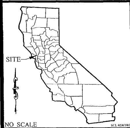
EXHIBIT B PARTIAL QUITCLAIM OIL AND GAS LEASE TO CSLC This Exhibit is solely for purposes of generally defining the lease premises, and is not intended to be, nor shall it nor shall it be construed as, a waiver or limitation of any state interest in the subject or any other property.

LOCATION MAP PRC 8377.1 OXY RESOURCES CALIFORNIA LLC OIL & GAS LEASE IN HOWARD, MONTEZUMA & GRIZZLY & ROARING RIVER SLOUGHS AND FISH & GAME LANDS ON HAMMOND & GRIZZLY ISLAND SOLANO COUNTY