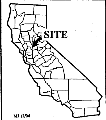
Exhibit A PRC 2610.1 PALMERO LLC GENERAL LEASE APNs 156-0110-046&007 MOKELUMNE RIVER SACRAMENTO CO.