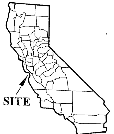
Exhibit A AD 488 WP 7196 Title Settlement and Exchange Agreement Pelican Homeowners Association and State of California Pajaro River, Watsonville Slough Santa Cruz County