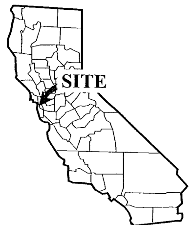
Exhibit A BOUNDARY LINE AGREEMENT CITY AND COUNTY OF SAN FRANCISCO

This Exhibit is solely for purposes of generally defining the subject premises and is not intended to be, nor shall it be construed as, a waiver or limitation of any State interest in the subject or any other property.