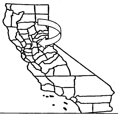
EXHIBIT B W 22791