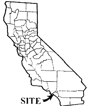
Exhibit A W25306 BOLSA CHICA ORANGE COUNTY

This exhibit is solely for purposes of generally defining the property, is based on unverified information, and is not intended to be, nor shall it be construed as a waiver or limitation of any State interest in the subject or any other property.