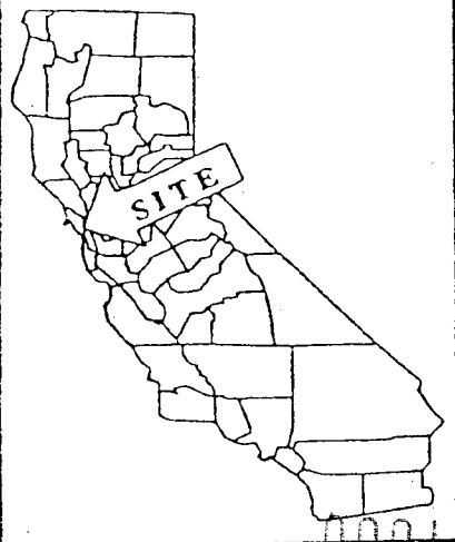
EXHIBIT "A" Site Map WP 5805 Dredging Long Wharf, Chevron Richmond Refinery San Francisco Bay Contra Costa Co.

NOTE: THIS EXHIBIT IS SOLELY FOR THE PURPOSE OF GENERALLY DEFINING THE LEASE PREMISE, AND IS NOT INTENDED TO BE, NOR SHALL IT BE CONSTRUED AS, A WAIVER OR LIMITATION OF ANY STATE INTEREST IN THE SUBJECT OR ANY OTHER PROPERTY.