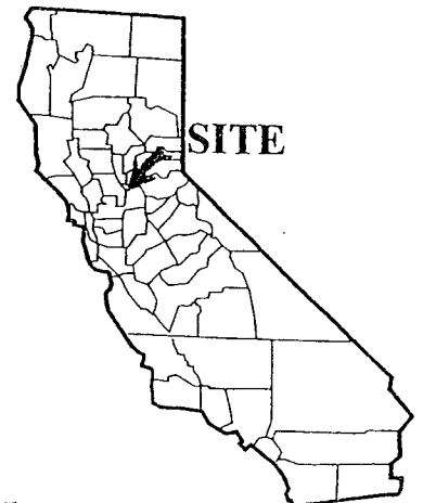
Exhibit A WP 4703.9 GENERAL LEASE PUBLIC AGENCY USE SACRAMENTO RIVER SACRAMENTO COUNTY

This Exhibit is solely for purposes of generally defining the lease premises, is based on unverified information provided by the Lessee or other parties and is not intended to be, nor shall it be construed as, a waiver or limitation of any State interest in the subject or any other property.