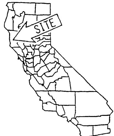
EXHIBIT A PRC 8069.9 Dredging Lease Noyo River Mendocino County

This exhibit is solely for purposes of generally defining the lease premises, is based on unverified information provided by lessee or other parties, and is not intended to be, nor shall it be construed as a waiver or limitation of any state interest in the subject or any other property.