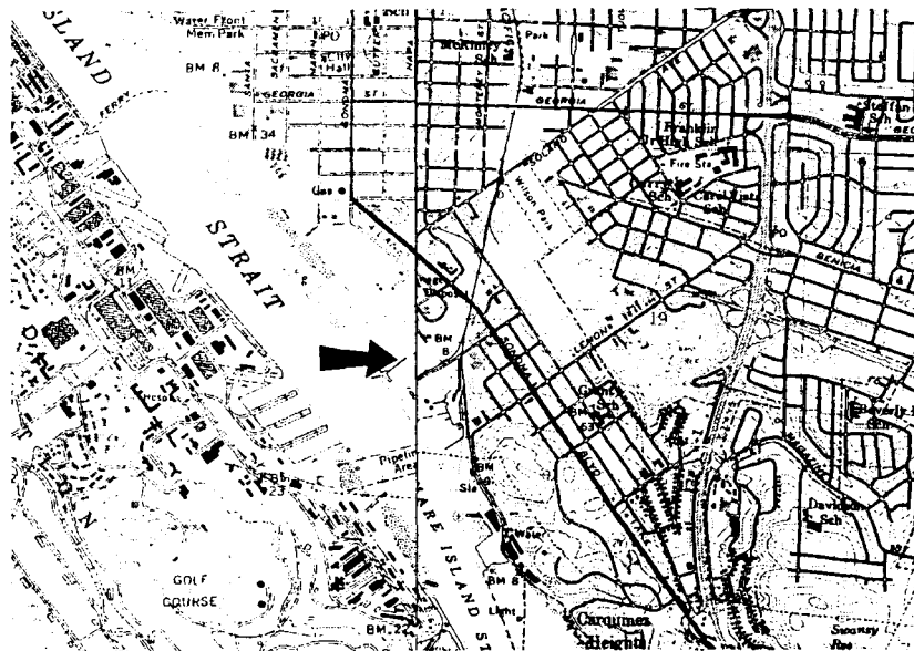
Exhibit A WP 8177

Maintenance Dredging Mare Island Strait Solano County