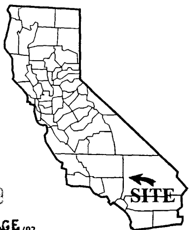
Exhibit A PRC 1531.2 PG&E Right of Way Lease SAN BERNARDINO CO.