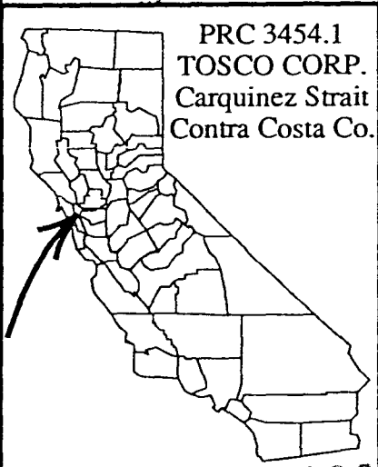
EXHIBIT B Location Map

PRC 3454.1 TOSCO CORP. Carquinez Strait Contra Costa Co.