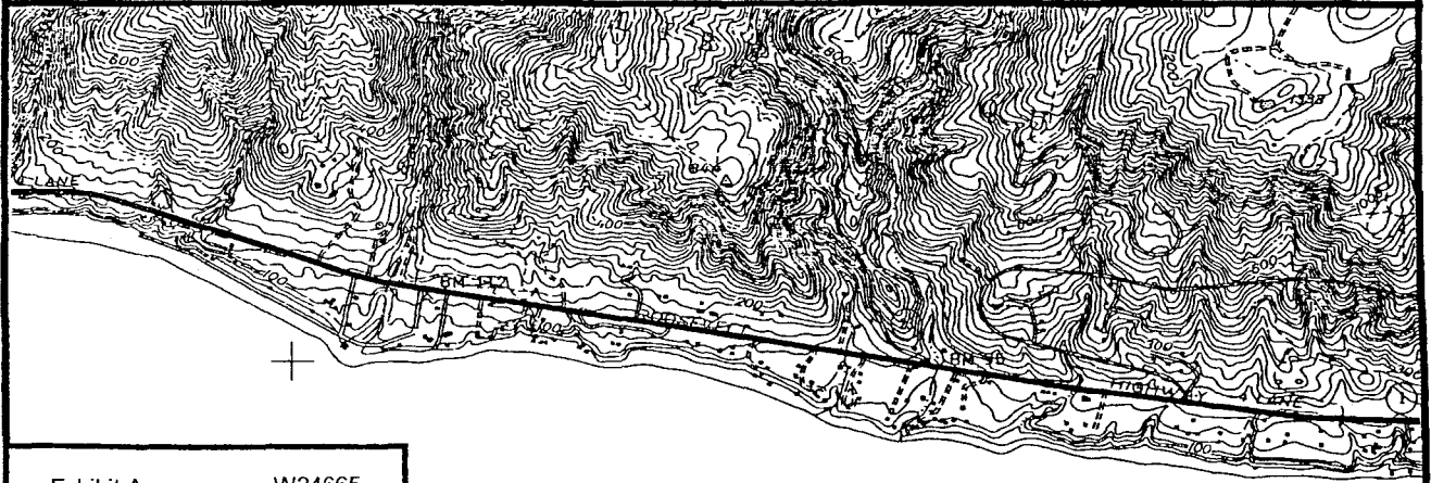
Exhibit A W24665 32320 Pacific Coast Highway