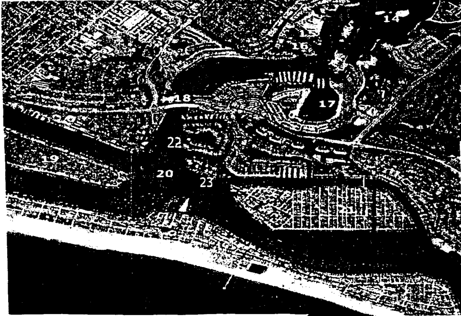
Exhibit A Location Map

LOCATION MAP W 25880 MAINTENANCE DREDGING LEASE NEWPORT BAY ORANGE COUNTY