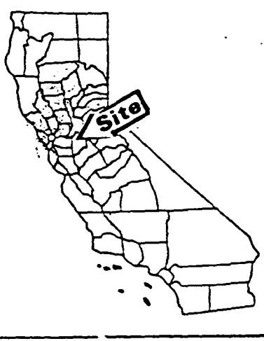
Exhibit B PRC 8029.9