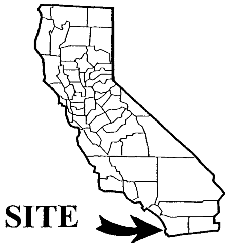
EXHIBIT A SHEET 1 OF 2