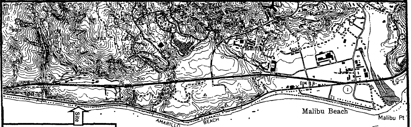
Exhibit A W24665 25030 Malibu Road