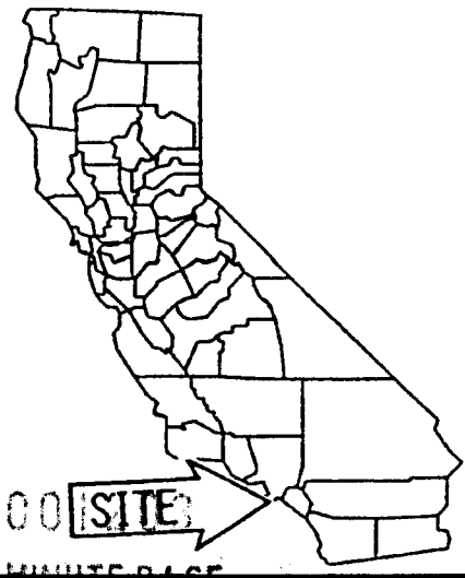
EXHIBIT "A" SITE MAP WP 3174.9 HUNTINGTON HARBOUR ORANGE COUNTY

This Exhibit is solely for the purpose of generally defining the lease premise, and is not intended to be, or shall it be construed as a waiver or limitation of any State interest in the subject or any other property.