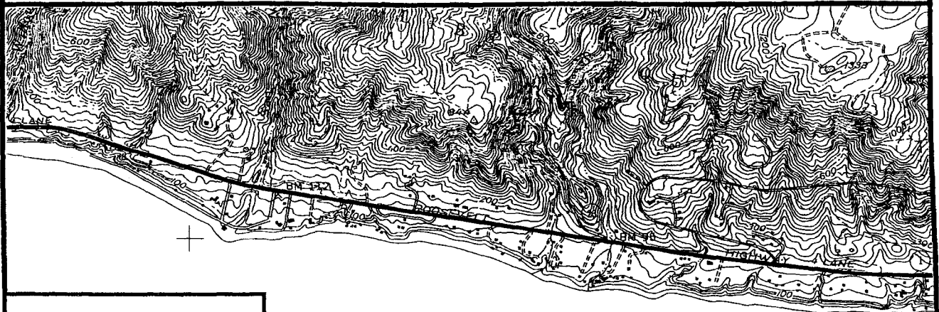
Exhibit A W24665 32340 Pacific Coast Highway