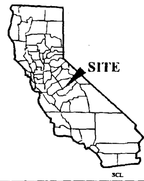
Exhibit E W25664 Title Settlement San Joaquin River FRESNO AND MADERA COUNTY

This Exhibit is solely for purposes of generally defining the lease premises, and is not intended to be, nor shall it be construed as, a waiver of limitation of any state interest in the subject or any other property.