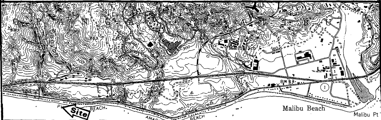
Exhibit A W 24665 25110 Malibu Road