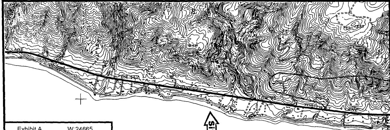
Exhibit A W 24665 33340 Pacific Coast Highway