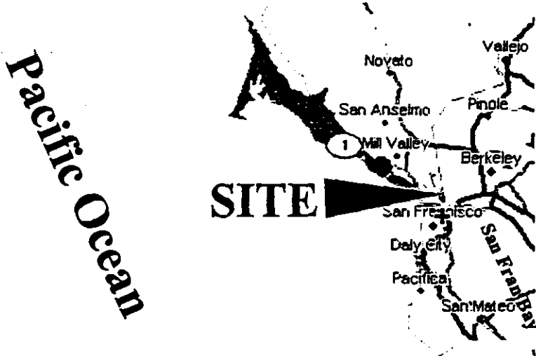
Exhibit A PRCs 709,2036,7780 MOE SAND CO. San Francisco Bay San Francisco and Marin Counties