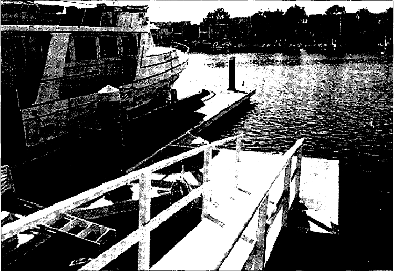
17051 Bolero Lane, Huntington Beach