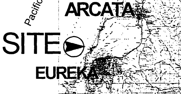
Exhibit A PRC 3186 Louisiana - Pacific Corp. Outfall Pipeline APN 401-111-06 HUMBOLDT COUNTY