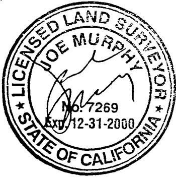
Exhibit A-4 W 25644