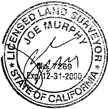
Exhibit A-5 W 25644