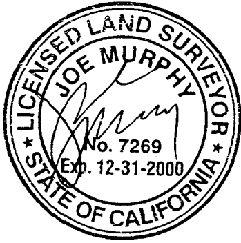
Exhibit A-6 W 25644