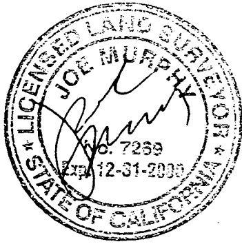
Exhibit A-1 W 25644