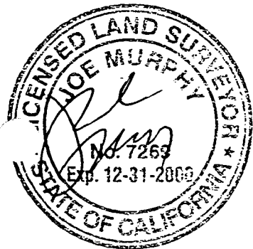
Exhibit A-7 W 25644