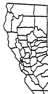
Exhibit B WP 7848