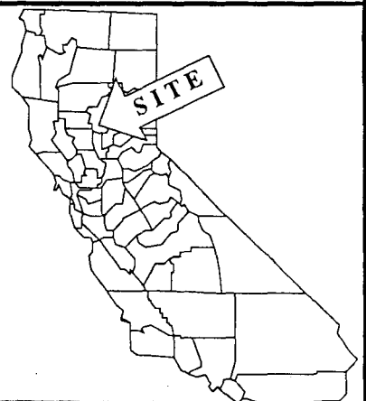
EXHIBIT "A" PRC 5852.1 6' Pipeline R/W Feather River BUTTE COUNTY

This Exhibit is solely for purposes of generally defining the lease premises, and is not intended to be, nor shall it be construed as, a waiver or limitation of any State interest in the subject or any other property.