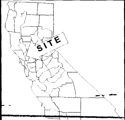
Exhibit A WP 5692 GL-Recreational Pier Petaluma River SONOMA COUNTY

Ten Foot use area around pier, boat house, deck and dock